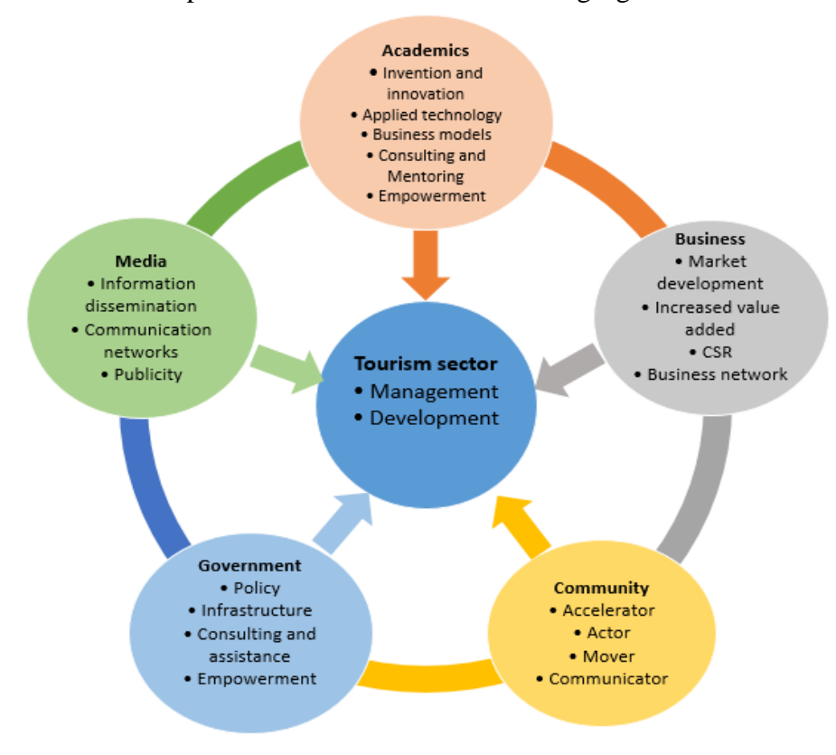
Figure 2: Pentahelix synergy in tourism development

The government's alignment with developing tourism in Indonesia is marked by the recognition of this sector as one of the economic pillars, especially in bringing in foreign exchange, increasing regional income and absorption of investment as well as reducing unemployment by opening up many new jobs. However, the development of this sector cannot only depend on the government, given that many parties are involved and have an interest. Therefore, there is a need for synergy in the management of the tourism industry, especially when faced with the situation in this new normal era. The pentahelix synergy in Batu City tourism development is as shown in the following figure: