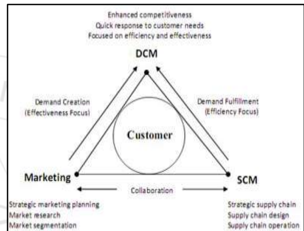
Figure 1: The Demand Chain Management

Therefore, DCM can leverage the power of marketing (selling) and SCM (deliver) and meet the customer value creation challenges in today's marketplace. This means that the DCM framework can be built based on two interrelated parts: marketing and SCM, with the customer as an integral part as shown in Figure 2.1. Interestingly, Miles & Snow's (2013) research reveals that demand chain management has an impact on performance and competitiveness. This opinion is also supported by research results Veerendrakumar, Narasalagi, & Shivashankar, K., (2015), which found that demand chain management has an effect on the competitiveness of small business in India.