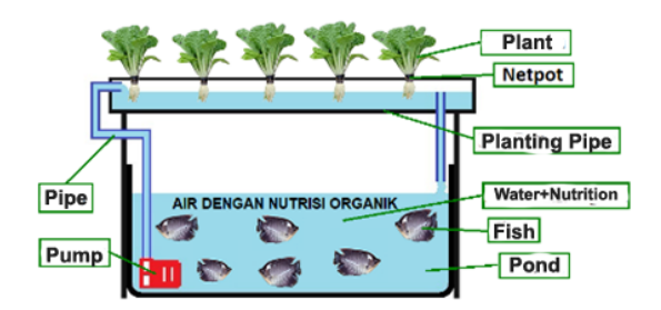
Figure 1. Hydroganic system

Hydroganic comes from the words "Hydro" and "Organic" which are defined as organic cultivation systems by combining the hydro system and the organic system. The main source of nutrition from hydroganic is obtained from solid and liquid organic fertilizer and pond water which is treated as plant nutrition (Yeniarta. 2017).