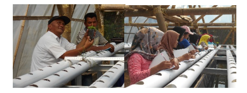
Figure 7. Socialization of Hydroganic Agriculture

Discussions in the form of and coordination were carried out in the field where hydropower was planted and in the house of the Head of Grangsil Hamlet.