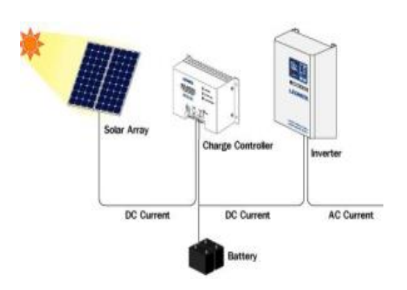
Figure 2. Photovoltaic Solar Energy Systems

Balance of System (BOS) required includes a charge controller and inverter, an energy storage unit (battery) and other supporting equipment (Widayana, 2012). This energy system will support the electricity needs of circulating water pumps that pump water from ponds to the pipe pipes where hydropower vegetables are planted.