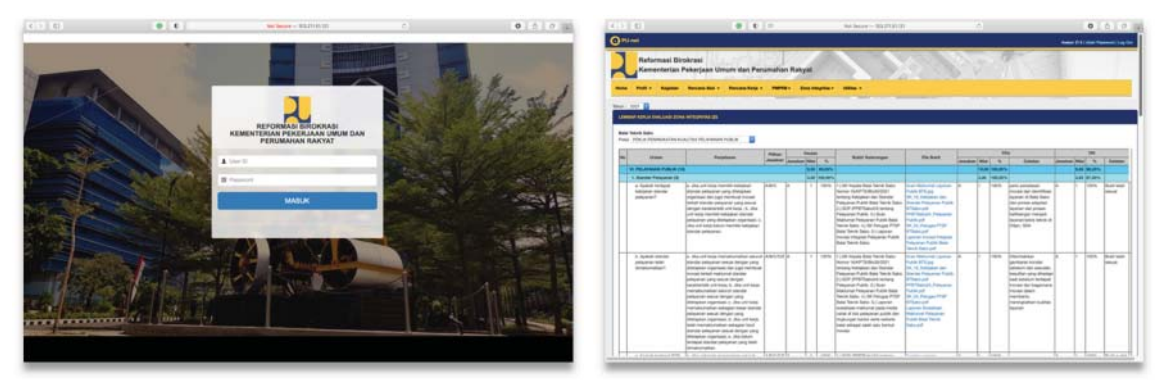
Figure 3. The dashboard of Bureaucracy Reform of the Ministry of Public Works and Housing

Filling out the evaluation worksheet (LKE) is the second stage of a series of activities, which provides an opportunity to complete the workload that is obligated to be carried out by Balai Teknik Sabo according to the existing documents and infrastructure of public services. Filling out the LKE will be the basis of the factual verification process carried out by the Internal Assessment Team and the Implementation Assistance Team to conduct a comprehensive evaluation of the Integrity Zone (ZI) development implementation at Balai Teknik Sabo. In filling out the LKE, it is mandatory to upload supporting documents required for assessment needs according to the assessed aspects. The documents that have been prepared and the self-evaluation result carried out are then entered into the dashboard of Bureaucratic Reform of the Ministry of Public Works and Housing (Figure 3). In the dashboard, the focus of this activity is on the quality-of-public services improvement working group with aspects include: 1) Service Standard; 2) Excellent Service Culture; and 3) Service Satisfaction Assessment.