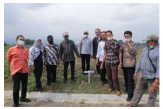
Figure 1. Discussion of Boundary Locations Before going to the Field Figure 2. Boundary Pillar Location Agreement