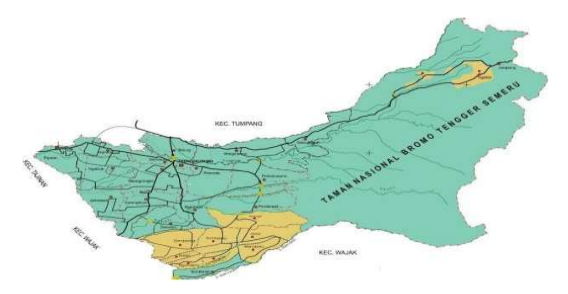
Figure 2. Administrative map of the Poncokusumo District