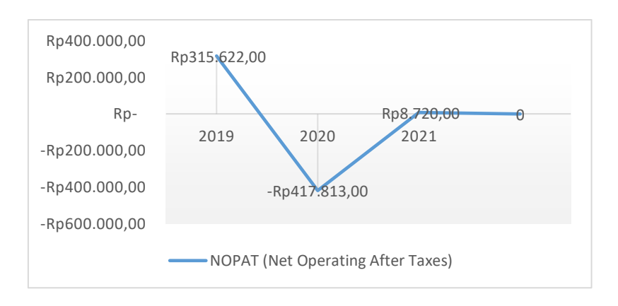
Figure 1. NOPAT of PT Blue Bird Tbk. (in millions of rupiah)

NOPAT aims to find out how much the increase in net profit obtained from business profit (loss) before tax minus tax (Brigham & Houston, 2020). The following is the calculation of NOPAT can be seen in the Figure 1.