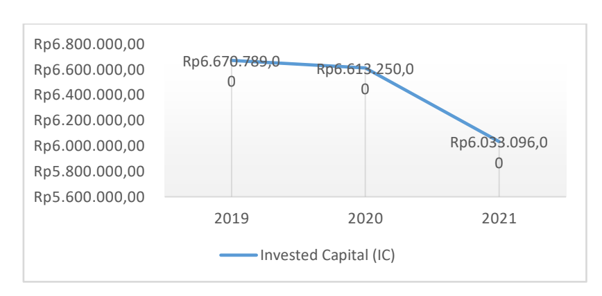
Invested Capital (IC) = Total Debt and Equity – Short-Term Debt

IC is derived from short-term loans plus long-term loans plus shareholders' equity or total debt and highest equity minus short-term loans (Brigham & Houston, 2020). It is formulated as follows: