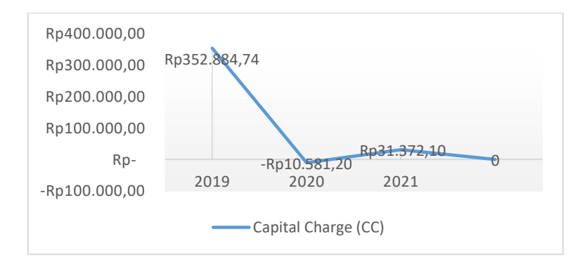
Capital Charge (CC) = WACC \times IC

Figure 4. CC of PT Blue Bird Tbk. (in millions of rupiah)