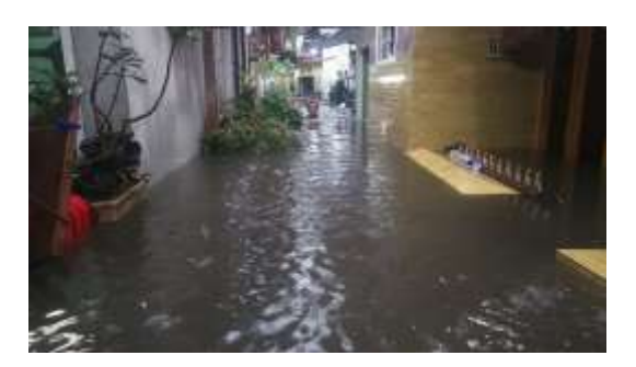
Photo 1. Inundation height during and 30 minutes after stormwater event.