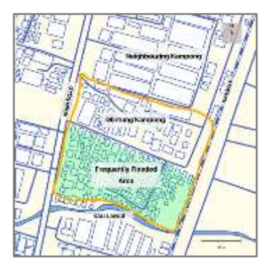
Figure 1 . The Situation map of Glintung Kampong location, bordered by the main road (at the west), higher density neighboring kampong (at the north), railroad (at the east), and Kali Lahar (at the East)

The study area is located in East Java Province, which is the province with the second largest population in Indonesia. The research object is Glintung Kampong, which is a floodprone area in Malang City, the second largest city in East Java Province. Glintung Kampong is also known as Glintung Water Street (GWS). The name GWS was inspired by the function of the roads in this kampong which turn into channels during heavy rain, especially on roads that are within a radius of \pm 100 m from the main drainage channel. Since the beginning of 2000, almost 50% of the area has been flooded every rainy season with an average flood height of 0.7 meters and a maximum of 1.5 meters. The kampong is bordered by a main city drainage channel, known as Kali Lahar, about 12 meters wide in the south. In the west it is bordered by a highway connecting two major cities in East Java Province, Malang and Surabaya. In the northern part, the kampong is bordered by a neighbouring kampong which is densely populated and at a higher elevation. In the eastern part there is a railroad with a higher position than the kampong. Therefore, the GWS kampong is like a pond during stormwater events. The condition worsens due to a backwater flow when the water level in the Kali Lahar increases and water overflows into the kampong. The location map of Glintung Kampong and the kampong condition during stormwater event are as shown in Figure 1 and Photo 1.